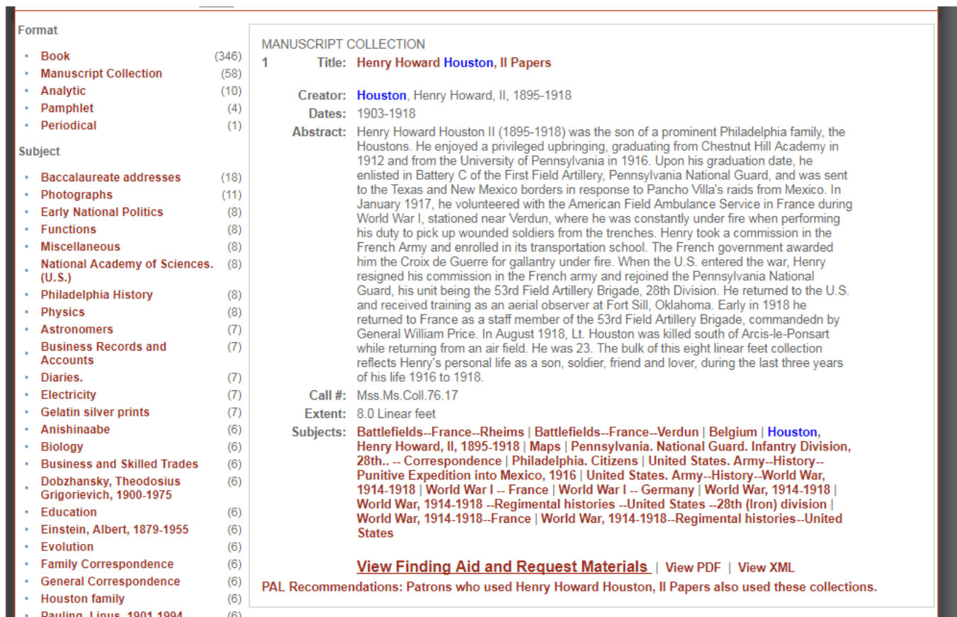
Figure 8. A link in the search returns that leads to recommendations based on finding aid search. Clicking on the link “PAL Recommendations: Patrons who used Henry Howard Houston, II Papers also used these collections” will open an HTML page with a list of links to finding aids.

Conversations with Atlas staff about PAL have been positive, and there is interest in building many of the features into future releases of Aeon. As of this writing, an open Uservice forum topic is taking votes and comments about this integration. 7